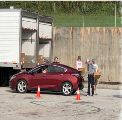
File image of a House of Raeford Chicken sale.